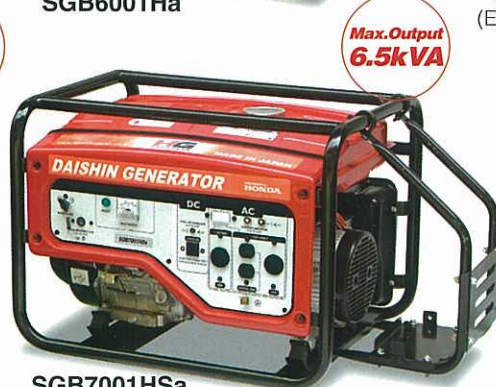
SGB7001HSa (Electric start model)