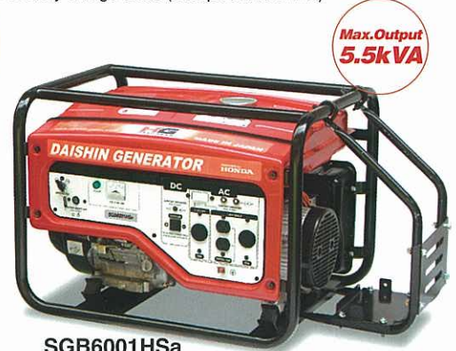
SGB6001HSa (Electric start model)